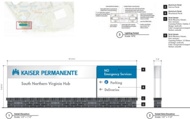
Monument Sign - Directional