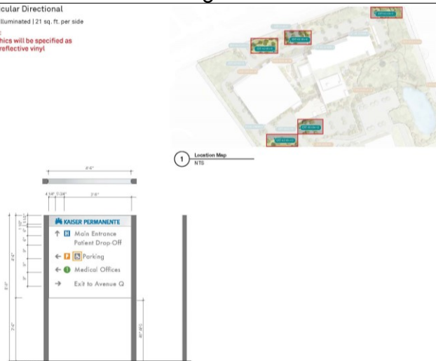
Vehicular Directional Signs