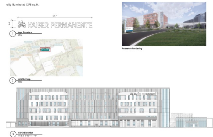
Façade Sign – North Elevation