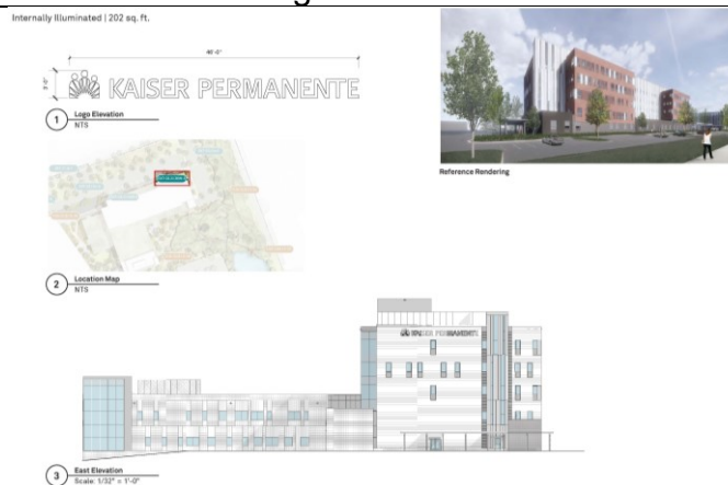
Façade Sign – East Elevation